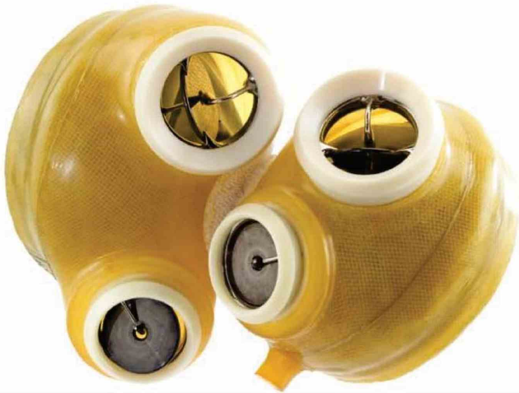
ARTIFICIAL HEART (MID-1970S) BY ROBERT JARVIK