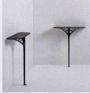
Left, the A.I. Lounge, with structure available in white, black, grey and green. To the side and below, the new A.I. Console, also made with the technopolymer created in collaboration with illycaffè by recycling espresso capsules.

→ sign, especially in the prototyping phase before the mold. He used the algorithm to optimize his project in terms of sustainability and reduce the material as far as possible, based on his design, of which at least 15% is saved. At the same time, by working on the voids, he enhanced its formal tautness. Just look at the beauty of the connection between the armrest and the rear structure in the armchair."